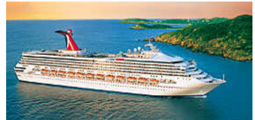
CARNIVAL Destiny Gross Tonnage - 101,353 Guest Capacity -3,360(Double Occupancy)